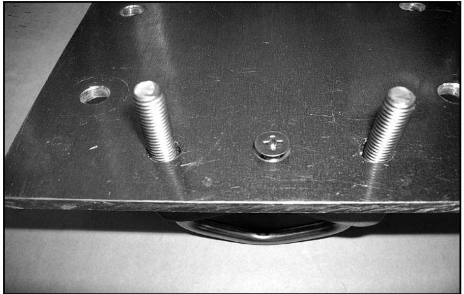
Figure 1 — A closeup of the V saddle clamp assembly: Note the countersunk Phillips-head bolt that secures the V saddle.

We constructed boom-to-mast brackets from these clamps and attached them on the 2 inch square boom. This boom and the fairly large plate allowed us to move elements around on the boom and facilitated attaching different baluns, stubs, and chokes to the LFA. We can actually move the boom-to-mast clamp to the very end of the boom and hold the antenna, and this allows us to move the elements around in many different