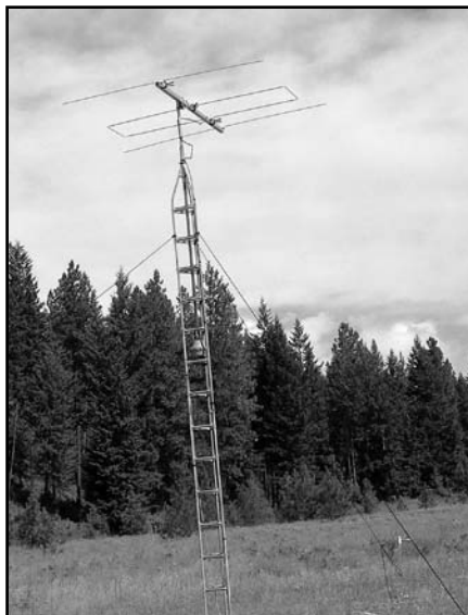
Figure 2 — The “BelchFire” 6 meter loop-fed Yagi

configurations and run antenna patterns and gain analyses.